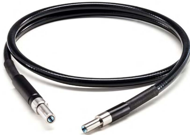
Photo below: Four-Pole Lightguide, Light-Entry: Lumatec D, Light-Exit: Lumatec Standard, Cladding: Silicone

Photo above: Single-Pole Lightguide, Light-Entry: Lumatec D, Light-Exit: Lumatec Standard, Cladding: PVC