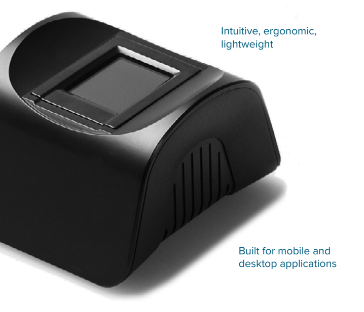
Compact PIV certified single-finger scanner