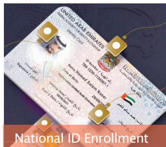
National ID Enrollment